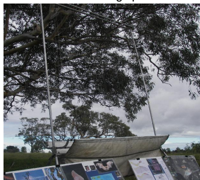
Bat catching nets

Jim Reside from Wildlife Unlimited came along to explain the different ways they survey fauna, for example how they catch microbats to determine which species are living in the area and by recognising frog calls to determine frog species.