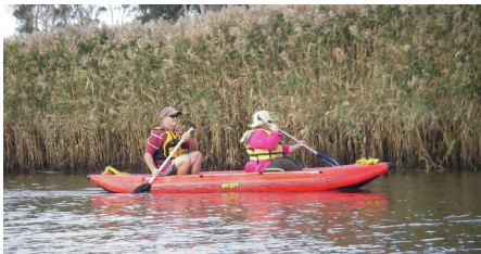
Participants paddle beside the tall phragmites reeds.