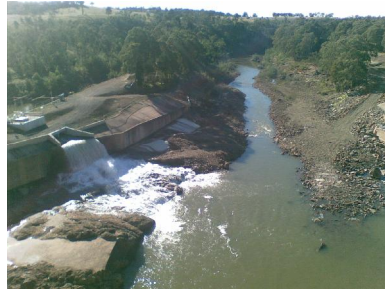
The weir at Lake Glenmaggie showing the water being released

The environmental flow releases are also a positive influence on the health and ecology of the waterways and will enhance and protect the vital needs of these rivers and those who depend on them.