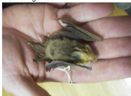
One of the many microbats that inhabit the Latrobe river