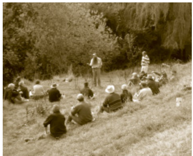
Clockwise from top: Workshop attendants inspect one of several water testing stations setup by the Gippsland Dairy Riparian Project. Workshop attendants focus on riparian zones.

Upon conclusion of the project a number of extension documents will be produced ensuring the knowledge is disseminated to other landholders through DPI extension officers and future Waterwatch workshops.