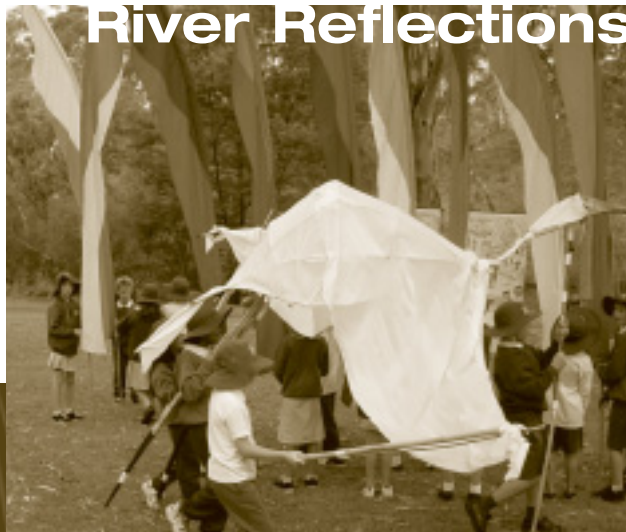
Viewbank Primary School students bring a Sacred Ibis puppet to life.

Waterwatch is a national community water quality monitoring program. The Victorian program has a dual purpose, it aims to educate Victorian communities to the value of our water resources whilst generating water quality data which is used, credible and accepted amongst natural resource management agencies.