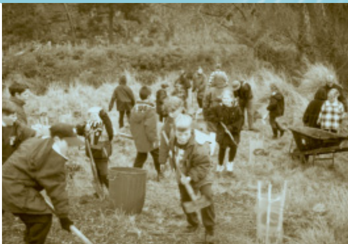
All pics: Students carry out revegetation activities.

The City of Ballarat-Linear Network of Communal Space is not called the LINC program for nothing! This program's partnership with Central Highlands Waterwatch has led to the creation and strengthening of a range of environmental initiatives in the Ballarat region.