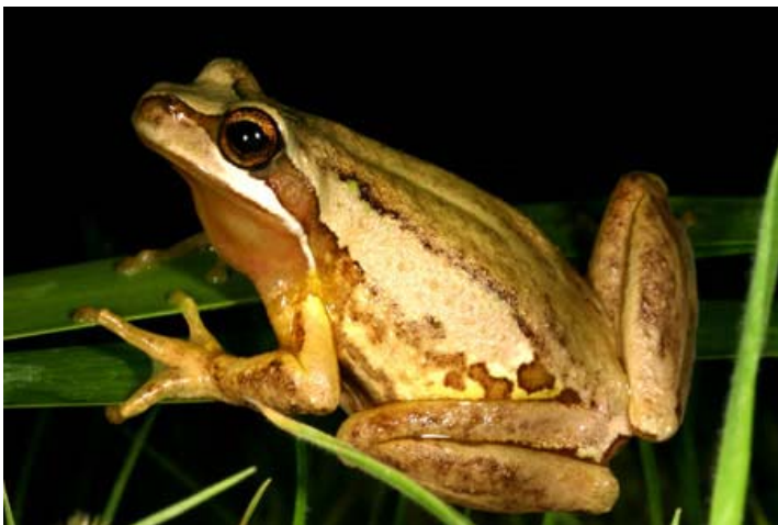
Dorsal view (Lydia Fucsko/frogs.org.au)

This frog is an agile climber and jumper which is capable of leaping to catch a fly in mid-flight! Colouring ranges from pale fawn, cream, orange to light brown along their sides and white on their belly. The back of their thighs are yellow to deep red. A pale stripe can be seen between the eye and upper jaw. Breeding males have a light brown vocal sac. They grow to a length of between 25 and 45 mm