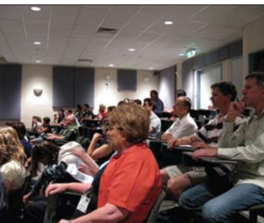
Participants at the 2007 National Waterwatch Conference.

The gathering of stakeholders and participants the conference produced also gave all an opportunity to reflect on and celebrate the job well done so far!