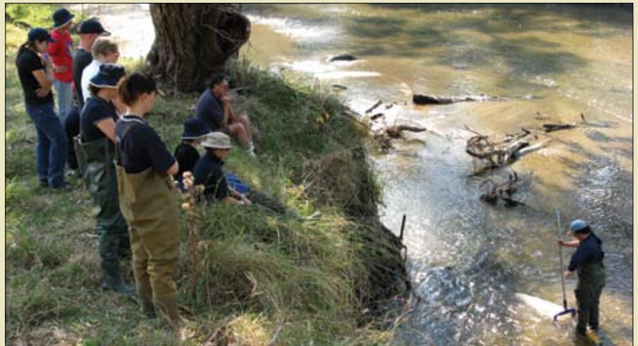
Waterwatch Coordinators brushing up on macroinvertebrate sampling techniques on the Kiewa River as part of the annual training program provided by Waterwatch Victoria.